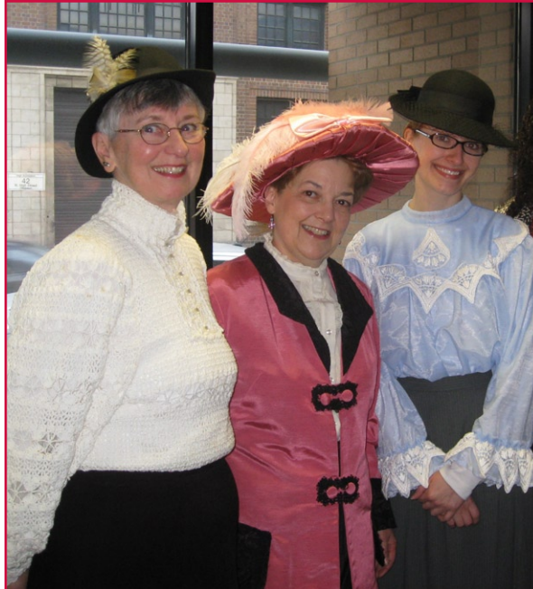
3 LWV-Akron Area Suffragists