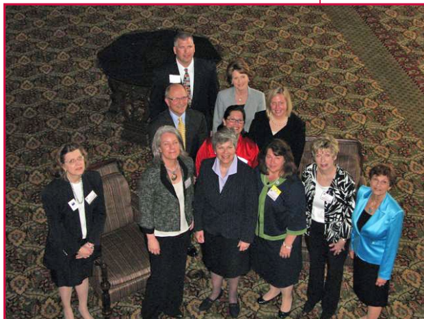
First Lady Strickland surrounded by League of Women Voters of Toledo-Lucas County members and Leadership Toledo Committee