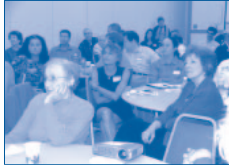
Audience members engaged by LWV-Athens County's explanation of redistricting issues.

state office. The staff not only attended to many of the details, but also provided a calming presence for us." Participants left the meeting with a new understanding